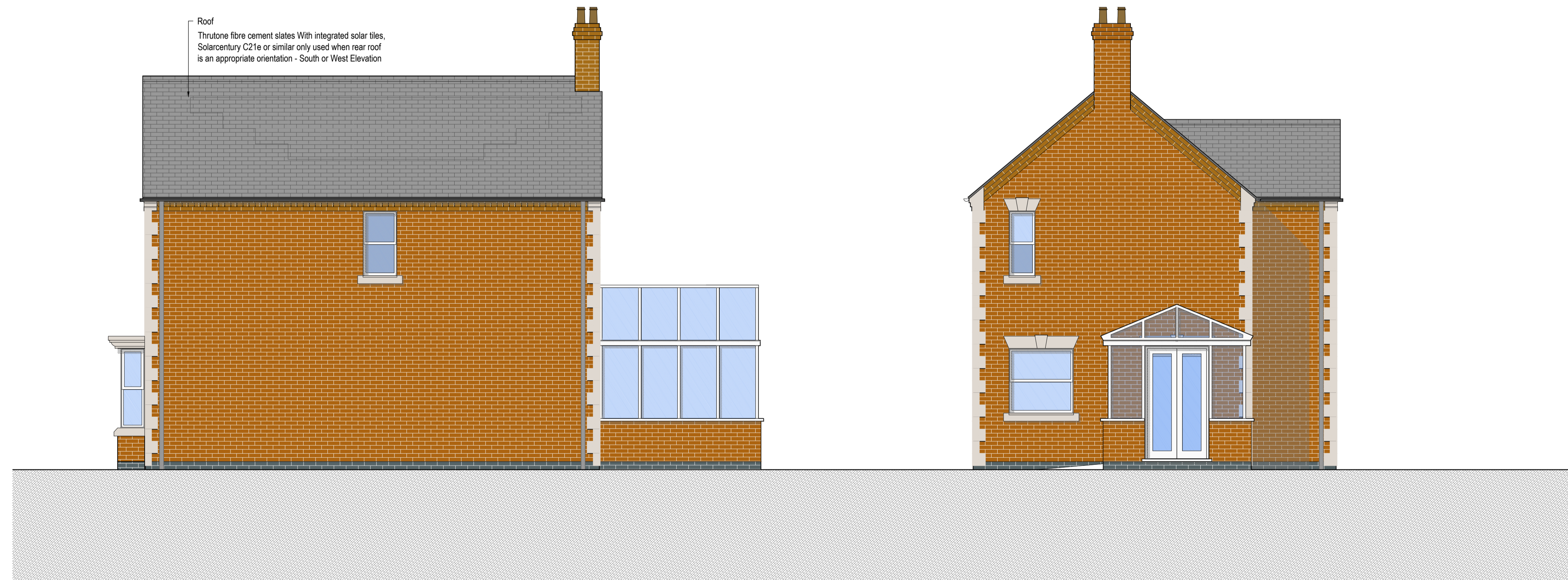
C Rear Elevation