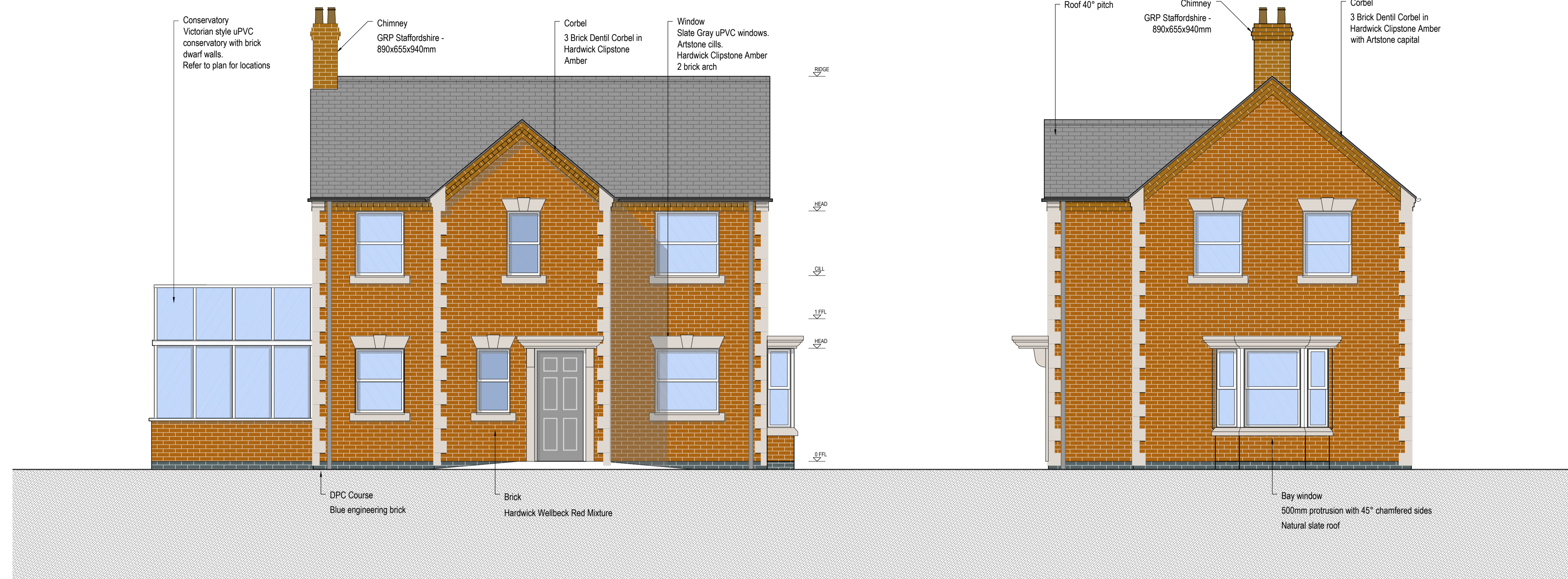
A Front Elevation